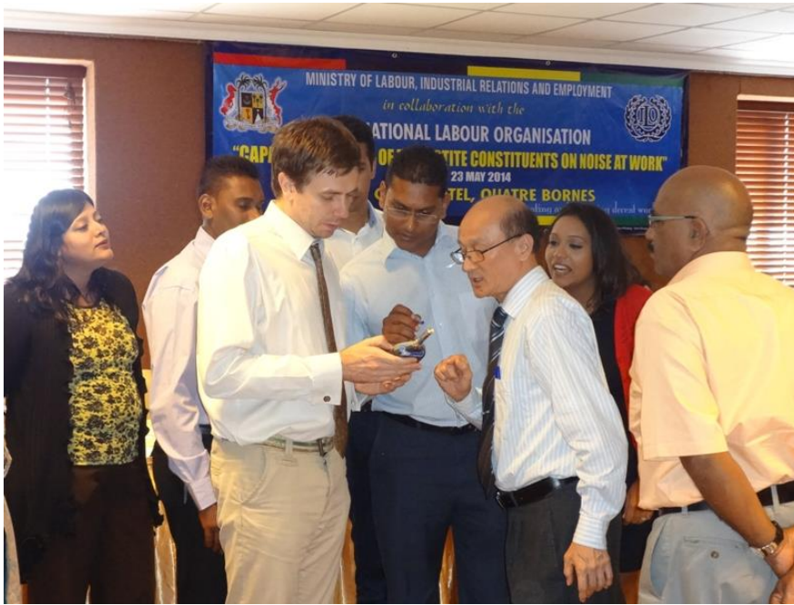
Capacity Building on Noise at Work for Tripartite Constituents from 19 to 23 May 2014.