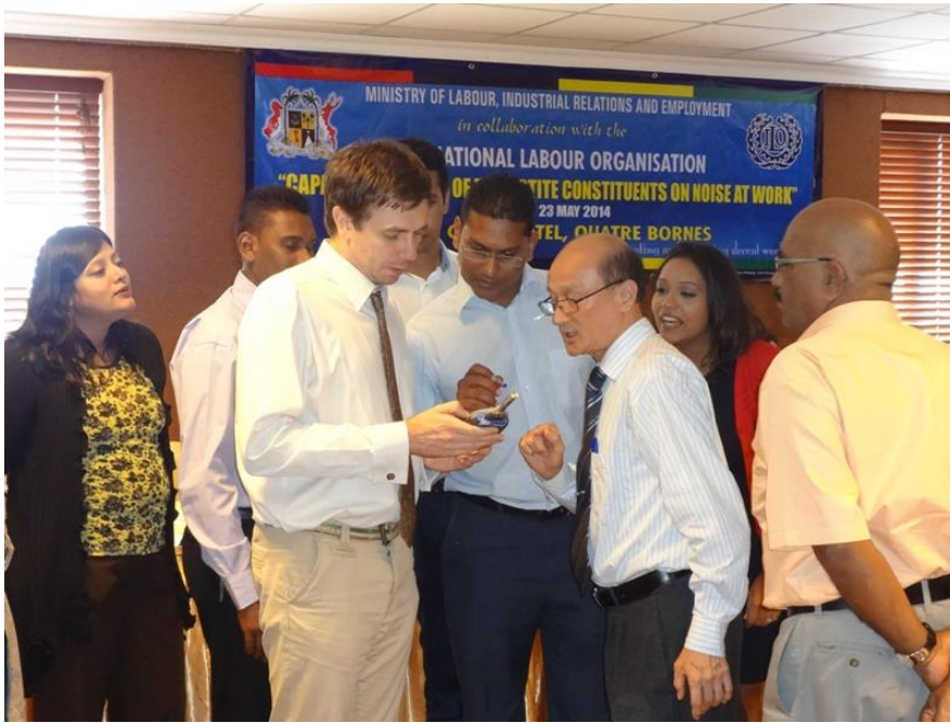
Capacity Building on Noise at Work for Tripartite Constituents from 19 to 23 May 2014.